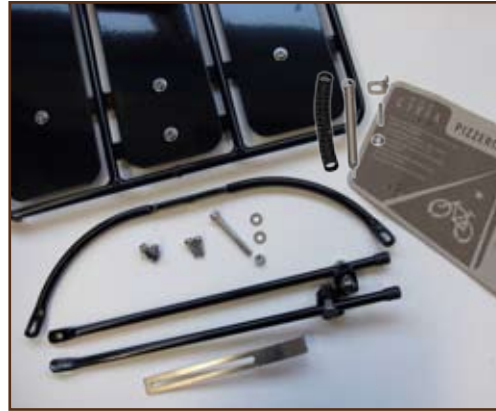
Pizzeria Rack and Hardware